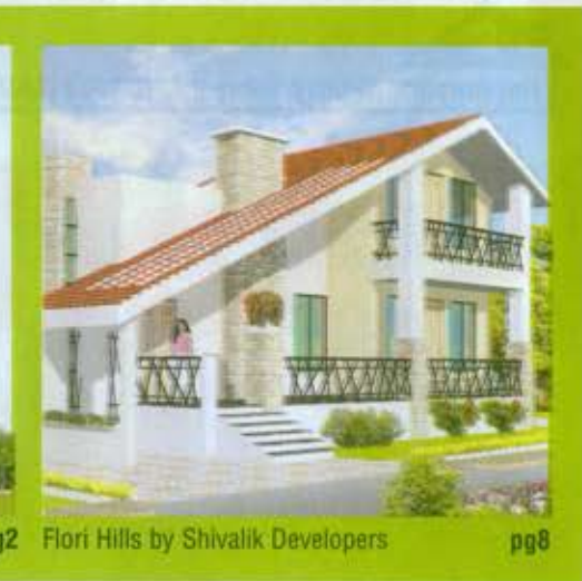
pg2 Flori Hills by Shivalik Developers